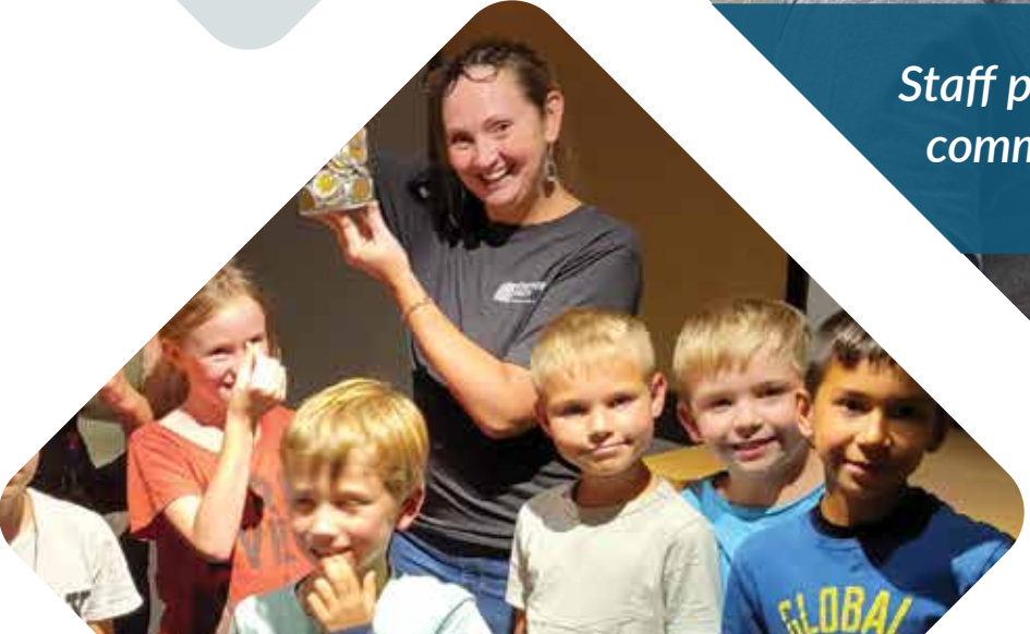
Teaching the future generation