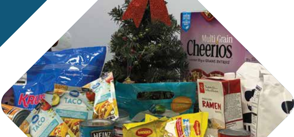
Supporting our local community and food bank