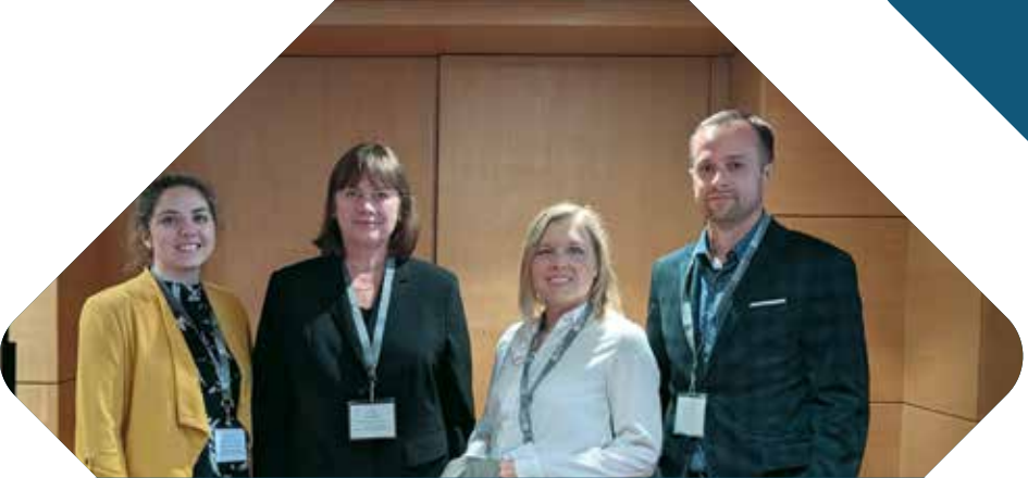
Estonian Canadian Business Chamber Launch Event