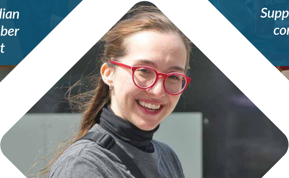
Staff participating in community events