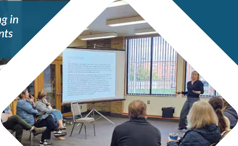
Members gain valuable knowledge at seminars led by our team